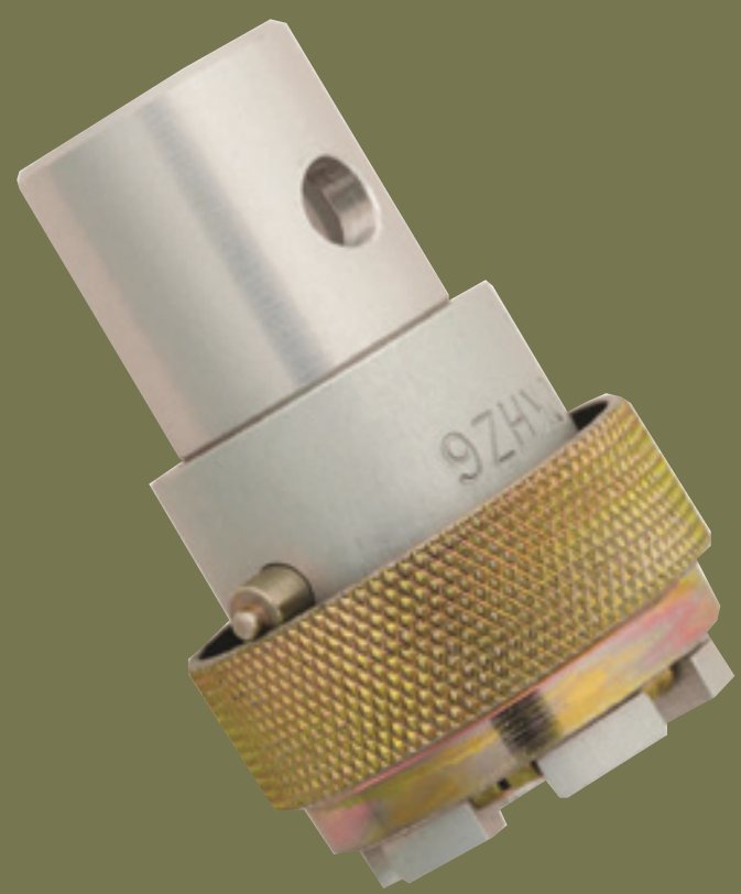
12 Jaw Chair Leg Stud Fitting w/ Hole