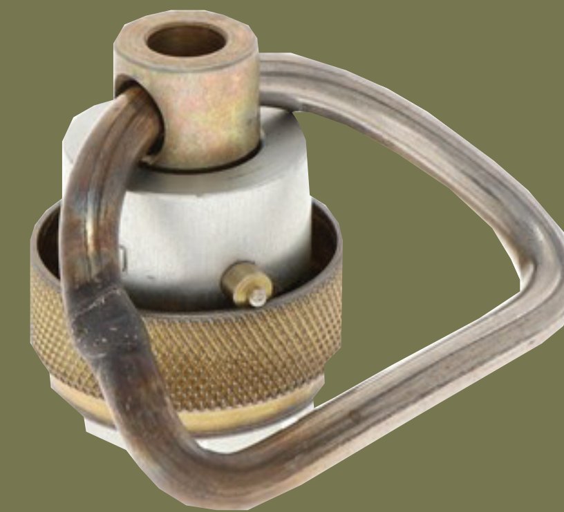
12 Jaw Fitting w/ Delta Ring