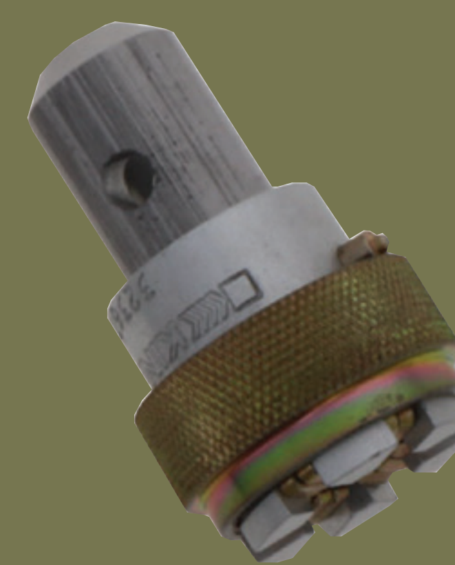
12 Jaw Leg Stud Fitting with Hole