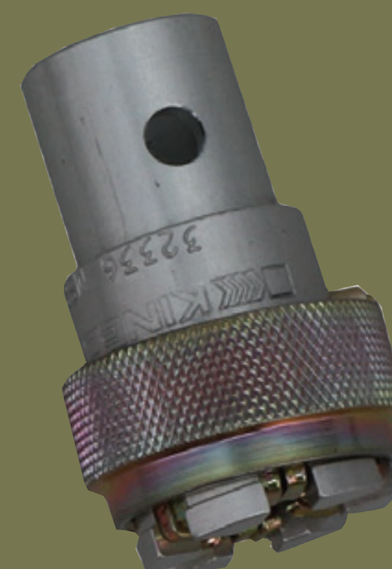
12 Jaw Chair Leg Stud Fitting w/ Hole

Part#: 32336 NSN#: 1680-00-592-4878 MS#: MS22034-2