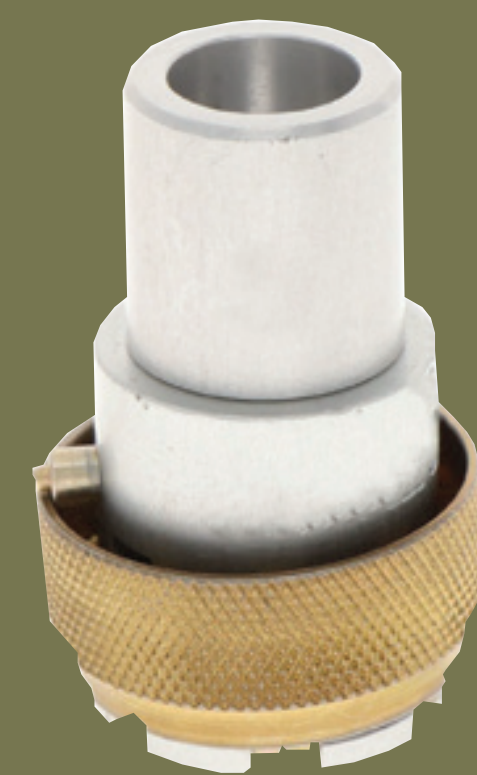
12 Jaw Chair Leg Stud Fitting

Part#: 32334 NSN#: 1680-01-097-3823 MS#: MS22034-1B