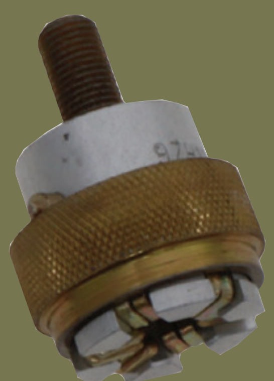
12 Jaw Stud Fitting w/ Thread Stud

Part#: 32334 NSN#: 1680-01-097-3823 MS#: MS22034-1B